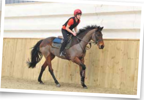
HEROS Racing Staff Academy

During the pilot year, in 2018, it became apparent that HEROS' individualised approach was working well and it received positive feedback from learners and potential employers. Local councils and social service partners are referring and financially supporting learners who may not have previously considered working with horses as a career option. This means we are now engaging with a new pool of recruits to help address the staff shortage being faced by the industry.